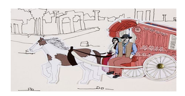
ROADSIDE ENCAMPMENT VISITS